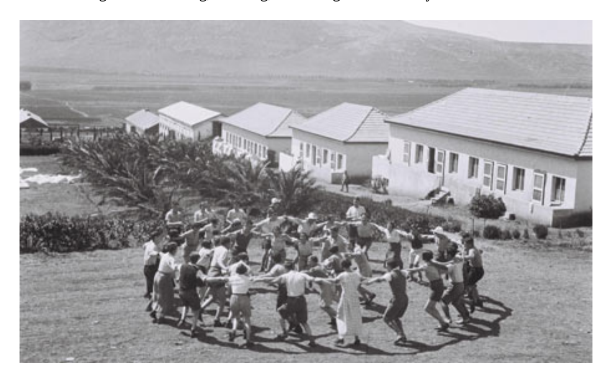
By Las Indias

A reference guide to learning, working, and living in community